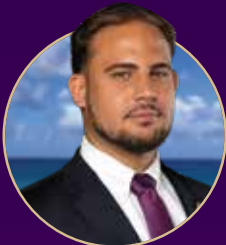
Jordan Rivers West Bay North